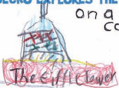
The Eiffel tower