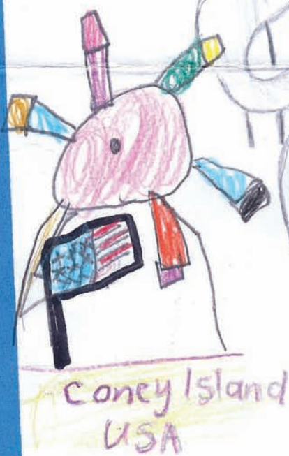
Coney Island USA

Please complete the details below. Parent details are kept confidential.